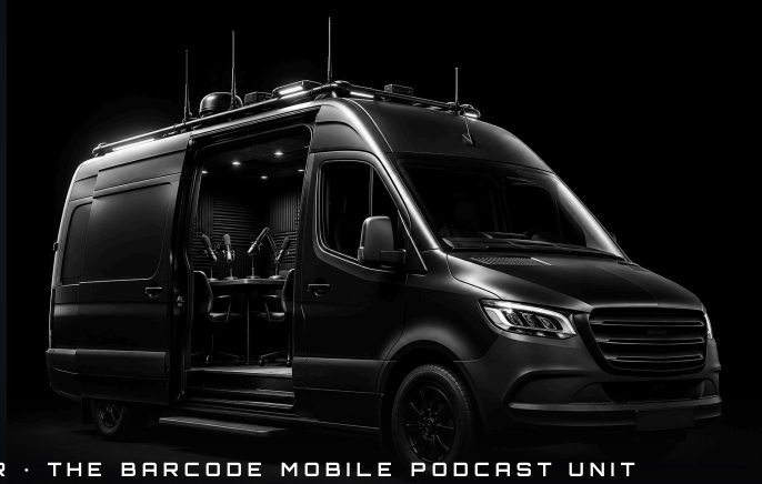
— CONCEPT RENDER · THE BARCODE MOBILE PODCAST UNIT

Beyond sponsorship, BarCode produces and advises. It's a different track for a different goal: we build for you, instead of placing you in what we run. Every engagement is scoped to your goals.